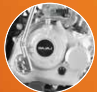
POWER 12 HP